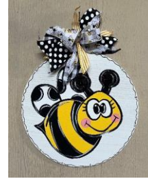
Bee Wall Hanging