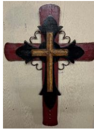
Wood Wall Cross 34" x 24"