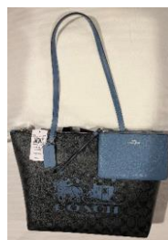
Coach Purse with Wallet