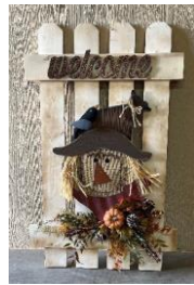
Scarecrow Fence Panel 36" x 20"