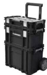
Stack and Roll Tool Storage

“Thankful & Grateful for the Sacrifice” “From Our Roots to Our Branches, Extending Service to Our Veterans”