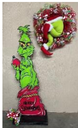
Wooden Grinch 48" Tall Grinch Wreath