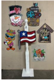
Porch Post & 6 Seasonal Hangers