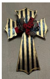
Wooden Wall Cross 34" x 24"