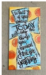
Cross Canvas Painting