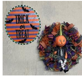
Halloween Wreath Trick-or-Treat Wall Décor