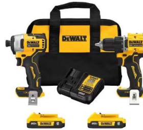
Power Tool Combo Kit