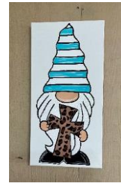
Gnome Canvas Painting